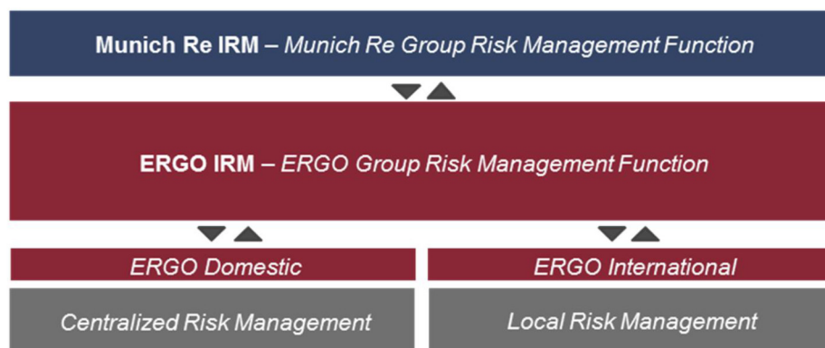
Figure 4. Risk Management Organization within Munich Re and ERGO Group

In ERGO the risk management function is carried out by Risk Management division. The Head of Risk Management reports directly to the CFO. Reporting lines have been set up between the head of risk management function and ERGO Group CRO.